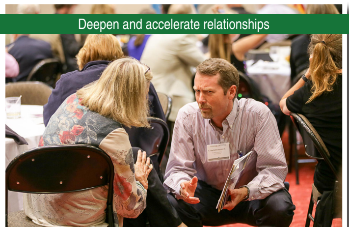
Deepen and accelerate relationships