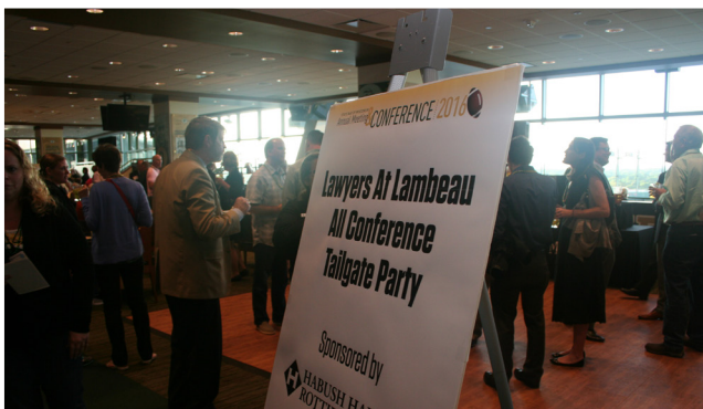
Enjoy the Social Events